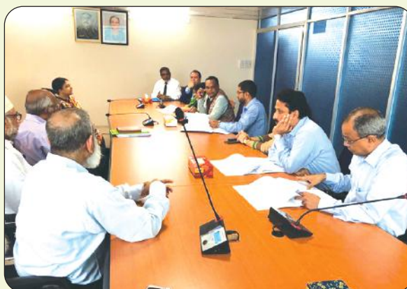
DG Health Meeting