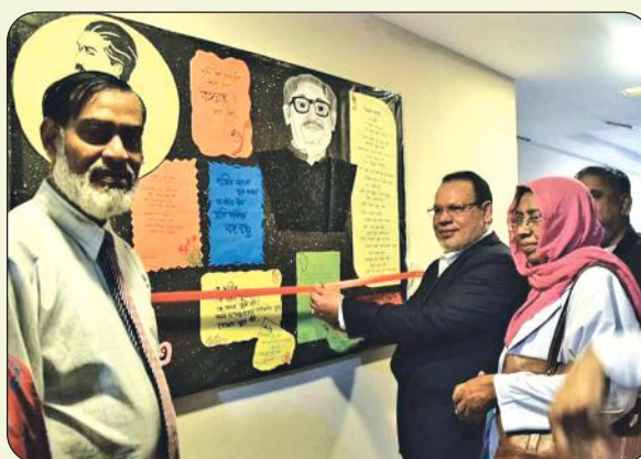
Mujib Borsho Udbodhon