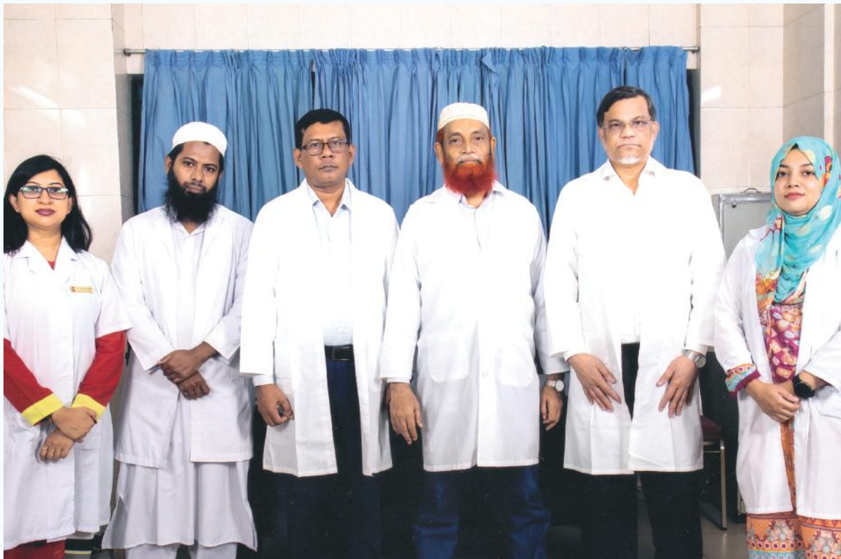
Group picture of Department of Surgery & Allied Subjects

Asstt. Professor & Head of Transfusion Medicine