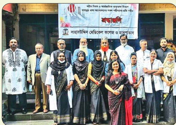
Antorjatik Matribhasha Dibosh