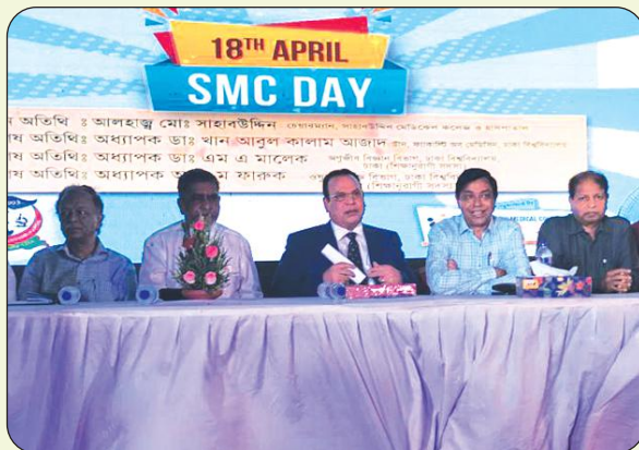
SMC Day Celebration