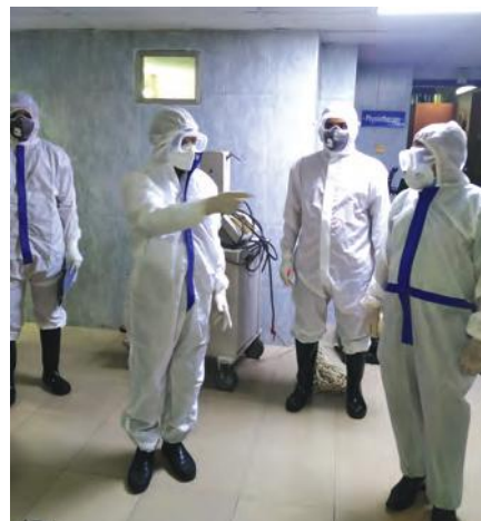
During 1 st Wave May 2020

Covid-19 Patients are being treated as per the national guidelines modified time to time. During the first wave of Covid-19, more than five hundred patients were admitted and treated in our hospital. Many were foreign nationals and were admitted and treated successfully. During the 1st phase only 12 patients died due to Covid-19 and its complications. Most of the patients recovered completely and went back to their as usual activities.