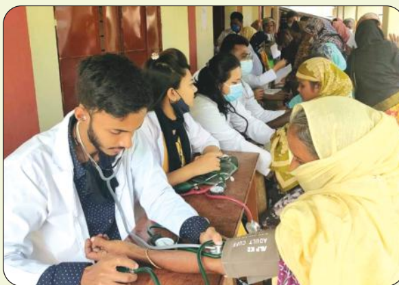
Free Medical Camp