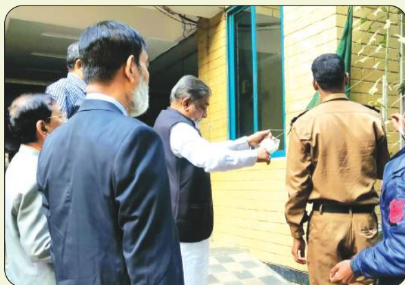
Victory day celebration