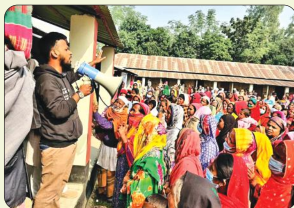
Free Medical Camp