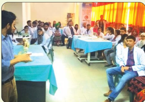
Basic Skill Development Course