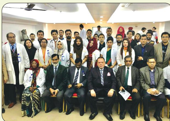
Founder Chairman with respected Faculty Member of SMCH