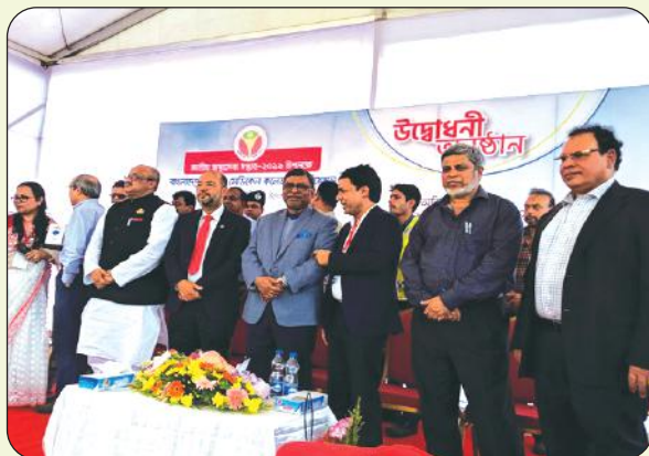
Inauguration of BPMCA Free Medical Camp-2019 in presence of Hon'ble Health Minister Mr. Zahid Maleque, SMC co-organized along with other Private Medical Colleges' of Bangladesh.