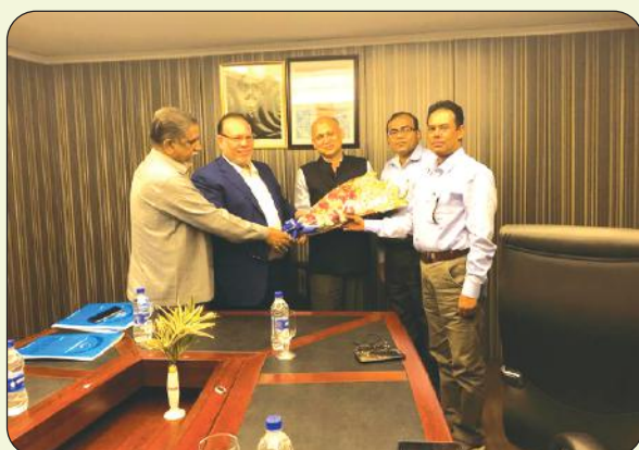
Governing body Meeting