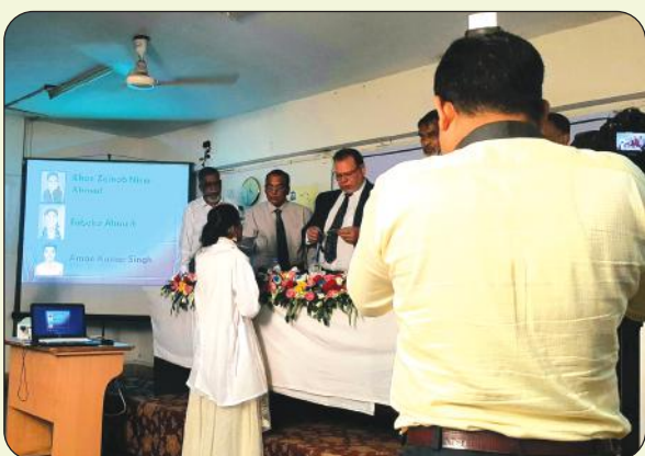
Orientation Program 2022