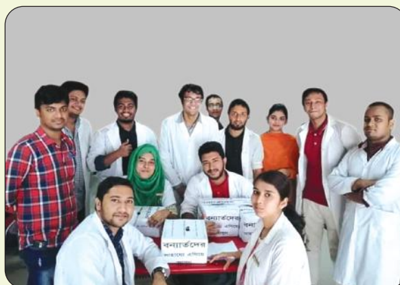
Fund Collection for Flood Victims