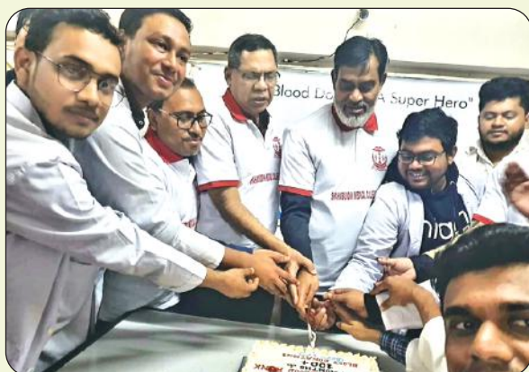
Onneshon Blood Bank