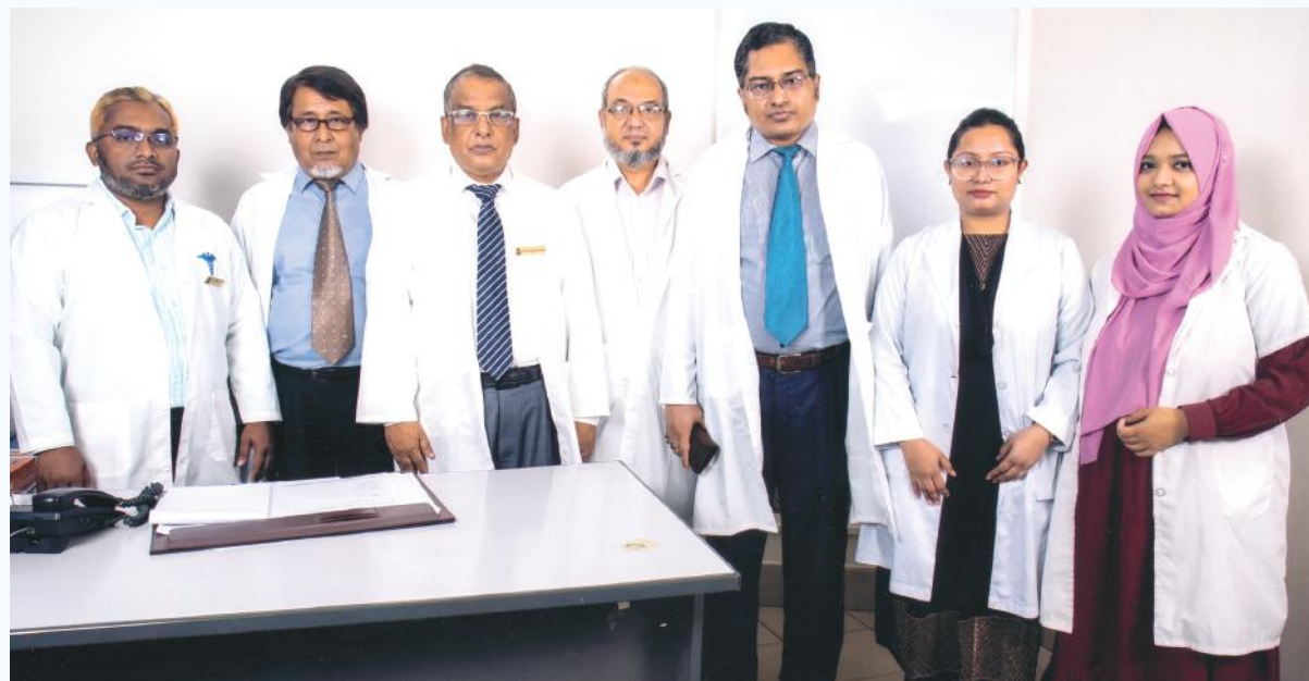
Group picture of Department of Medicine & Allied Subjects