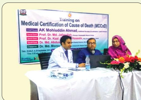
Training on Cause of Death