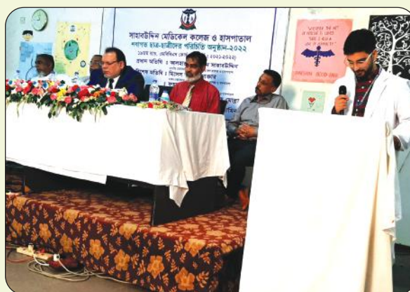
Orientation Program 2022