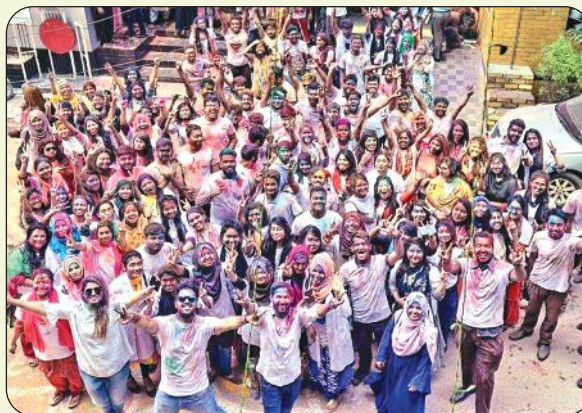
SMC Day Celebration