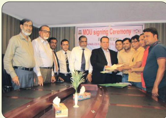
Corporate Patient Care Service