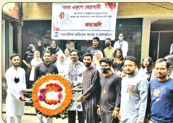
Ekushey dy Celebration