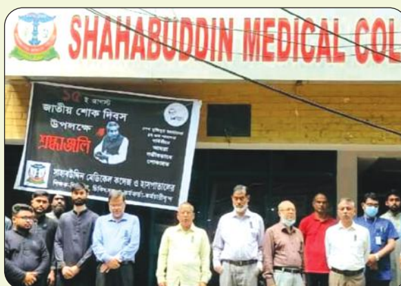
National Mourn Day